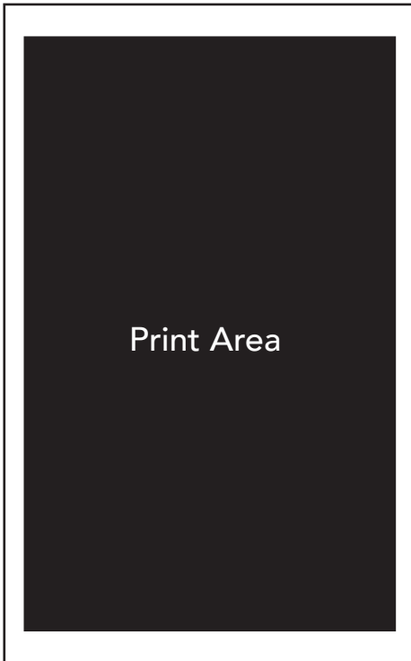
Full page | 5" x 8"

All FONTS must be converted to outlines for print